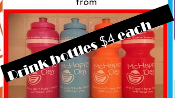
Pink, Blue, Orange, Red, Green Purple

McDonald's Greta has kindly donated to our School a 45L Drink dispenser for our children to benefit from